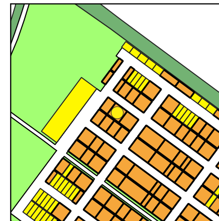
Lutze Process Denmark ApS C85