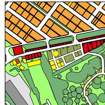
Agrometer A/S 4