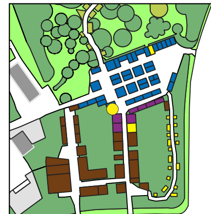
Gammelrand beton 10