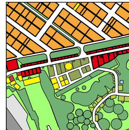
LINDS SEMENCO 10